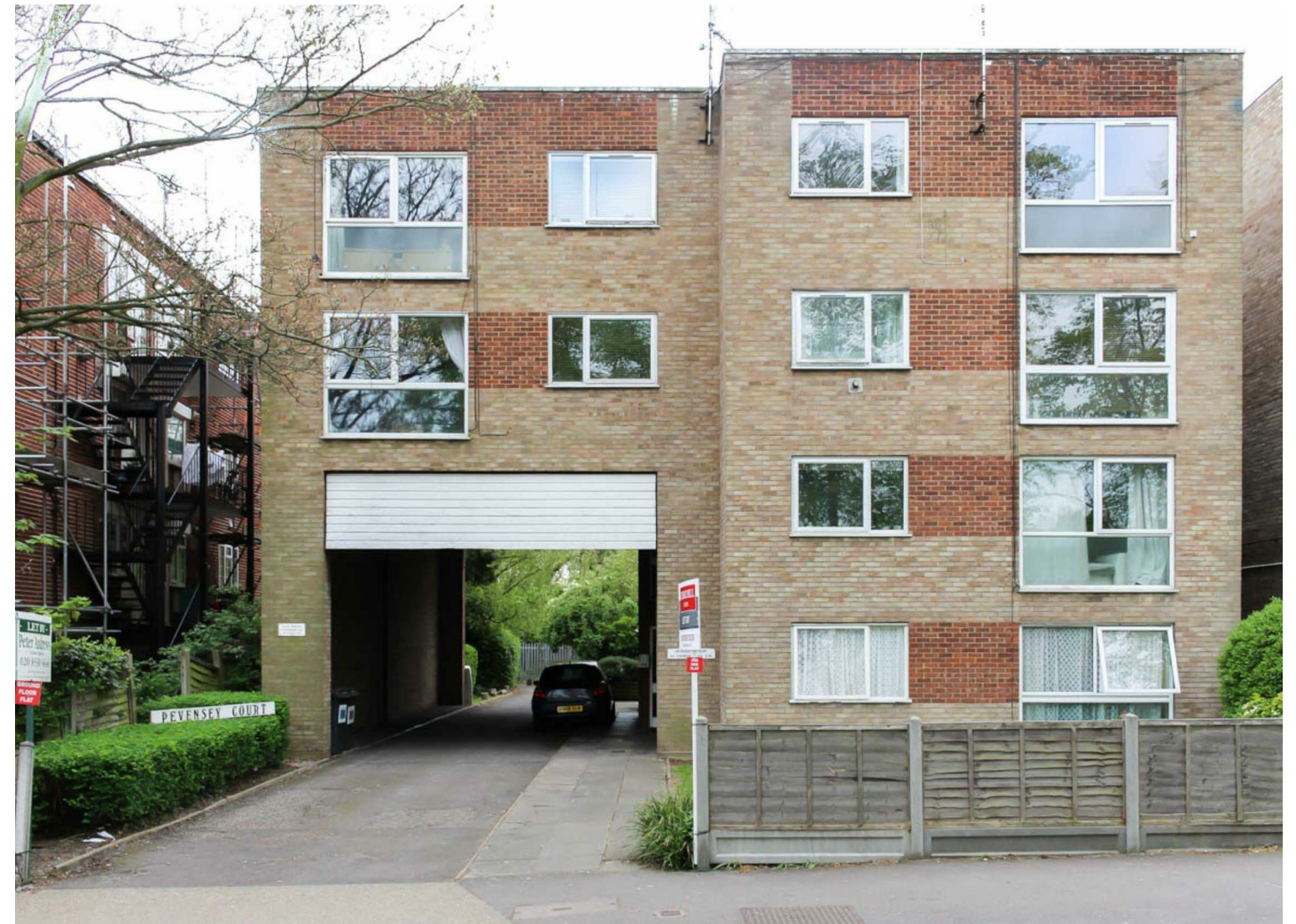
Pevensey Court, South Woodford, E18 £1,400 Per Month